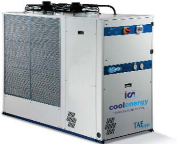
Cool Energy's Rental TAE 121 unit

The chiller models are available in the following duties bands: