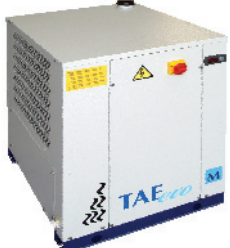
The smallest of Cool Energy's units. the TAE M03 (above left) and the slightly larger M10 (above left)