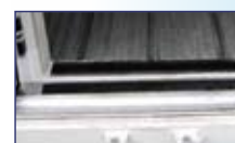
Anti-slip material for extra safety