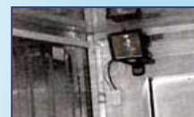
Internal halogen light with sensor, distress alarm and pressure valve