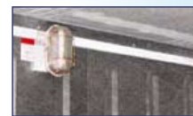
Internal lighting safety lights and lamp with sensor