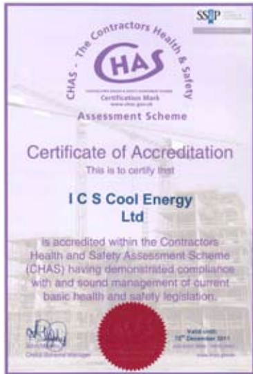
ICS Cool Energy on CHAS website

The Scheme is recognised as a market leader in the UK for health and safety qualification and competence for suppliers of services and goods.