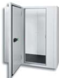
Modular Walk-in Coldstores

Rental is tax efficient - talk to your financial expert as your rental costs could be used to reduce your corporation tax payments.