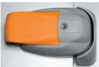
Safe and secure

The store is delivered and then constructed on site, which reduces the cost of delivery and allows for doorway delivery to simplify installation in small kitchen and production areas.