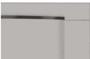
Easy to clean and durable